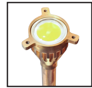
4w LED Panel integrated into heat sink hub

NOTE: 120v - 277v options available with remote LED driver. Must use FA-26 mounting post or FA-JBOX junction box to house remote driver.