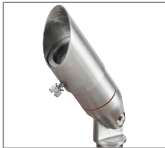
Model: Pinner Finish: PVDS